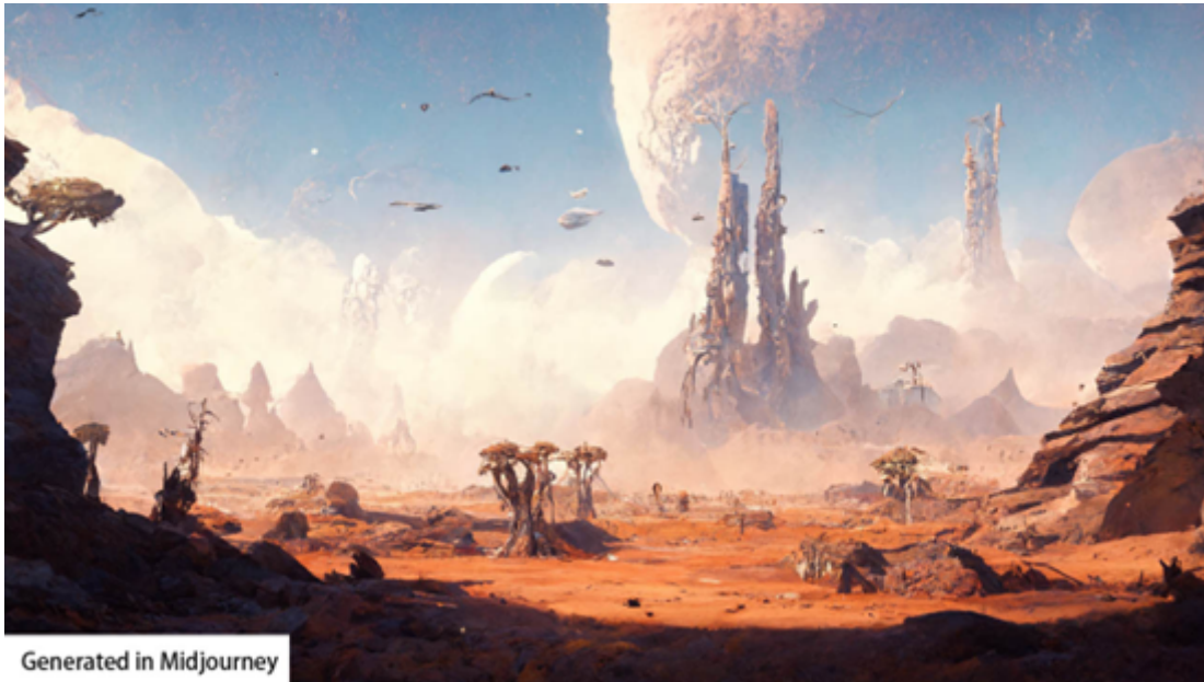
Generated in Midjourney