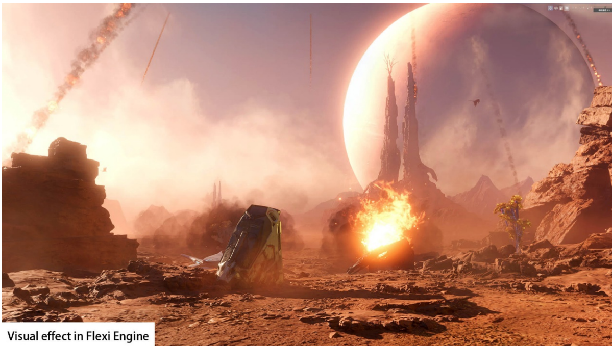
Visual effect in Flexi Engine